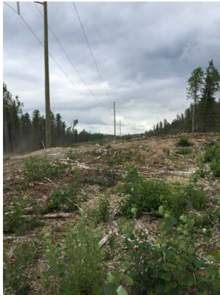
Whitefeather Forest – IFA field portion 2018