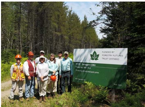
770-1-R30: Intensive Stand Management of Pine and Spruce Plantations, Temagami Forest, 2011