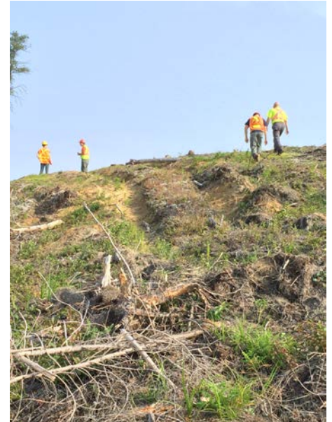
Dryden Forest – IFA field portion 2018