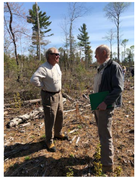
IFA Auditor Orientation Workshop 2018