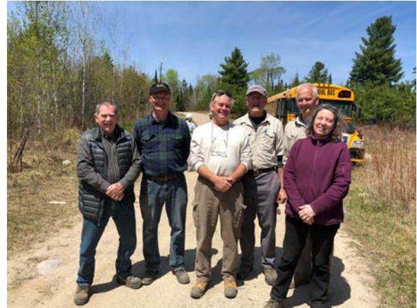
Forestry Futures Trust Committee 2018

The Forestry Futures Trust fund is in a healthy position and has fully recovered from the economic difficulties that previously affected the sector. The fiscal financials, which provide the details, are available through our website, www.forestryfutures.ca once tabled in the Provincial Legislature.