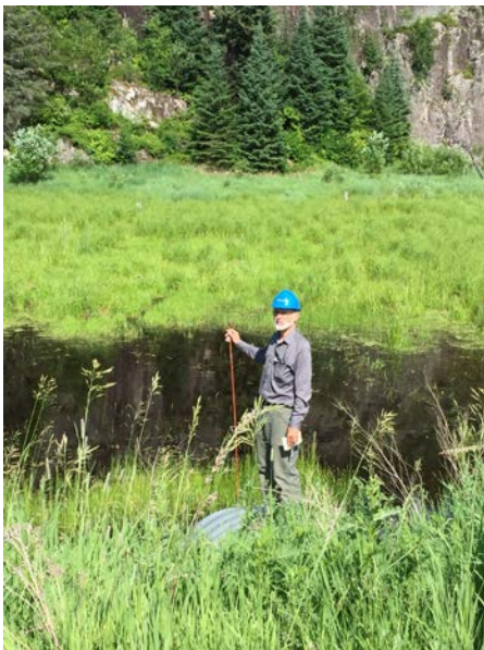
Kenora Forest – IFA field portion 2018

The French-Severn Forest (ESFL005-2014) remained open, however, no progress was reported in the 2018-2019 fiscal year.