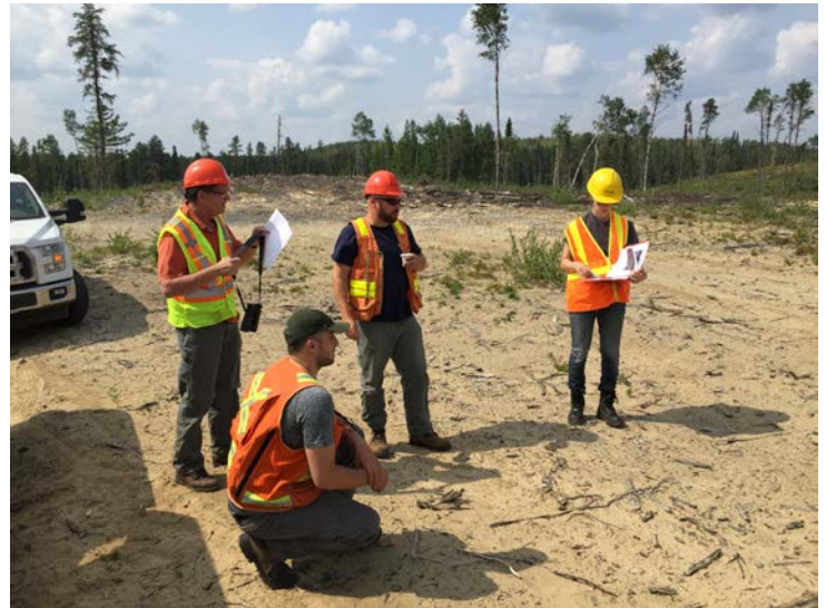
Dryden Forest IFA field portion 2018

For more information follow the links on the MNRF website: www.ontario.ca/page/forest-tenure-modernization or visit the NFMFC website: www.nfmcforestry.ca