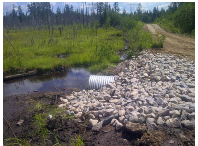
Ottawa Valley Forest IFA field portion 2018

The final reports of the 2018 Independent Forest Audits have not yet been tabled in the Ontario Legislature and as such remain confidential. Therefore, we are unable to report the specific findings. The results of the audits are similar to previous years in that they identify areas for improvement but also best practices that are taking place across the forest audited landscape. The details of these audits will be publically available on https://www.ontario.ca/page/independent-forest-audits once tabled in the Legislature.