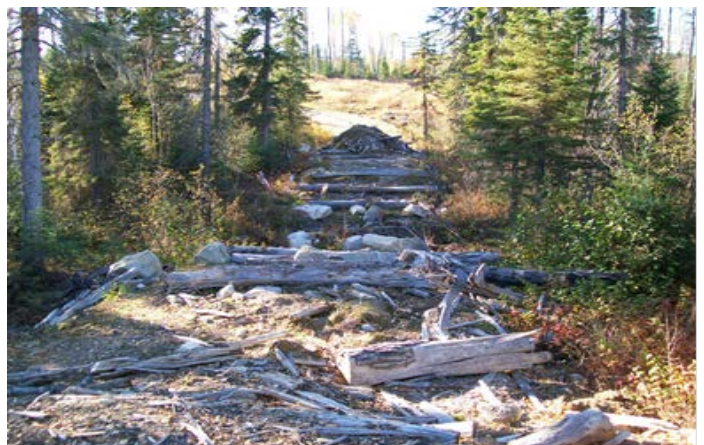
Decommissioned and rehabilitated water crossing on the Big Pic Forest

Throughout 2014 the Ministry of Natural Resources and Forestry (MNRF) undertook an Independent Forest Audit Modernization Project. The purpose of the project is to identify potential modifications to the audit program to reduce costs to key parties and gain efficiencies, while maintaining the effectiveness of the audit program. The revised IFA program may be risk based and will focus on those elements of forest management deemed to have the most potential impact on forest sustainability. A risk assessment of the IFAPP was underway by MNRF at the end of the fiscal year 2014. Although the IFAPP risk assessment is being led by the MNRF, auditors and Forestry Futures Committee input has been provided to ensure a balanced risk assessment. MNRF and FFC will test the new model in the 2016 audit year.