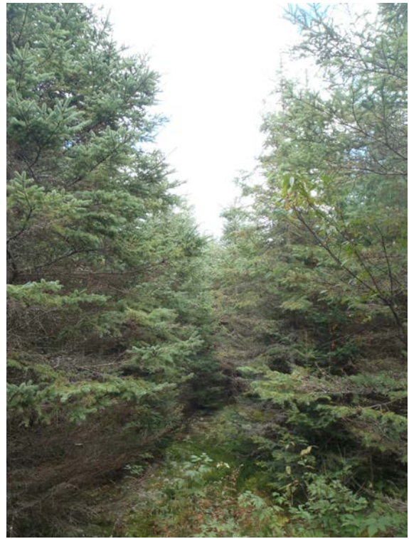
Manual tending of spruce and white pine from French Severn site visit

For more information follow the links on the MNR website: www.ontario.ca/page/forest-tenure-modernization .