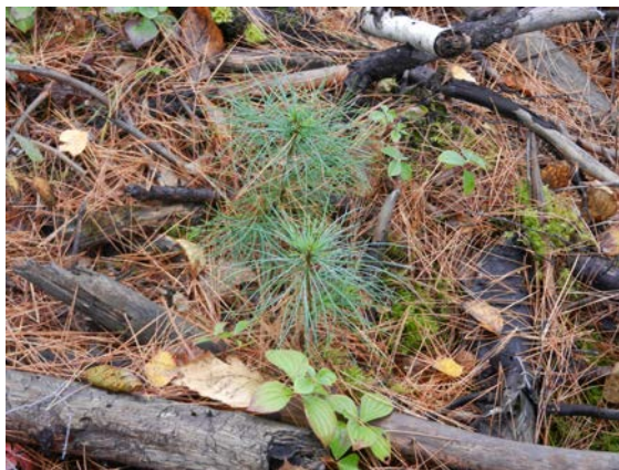
Natural white pine regeneration from the Sudbury Forest site visit