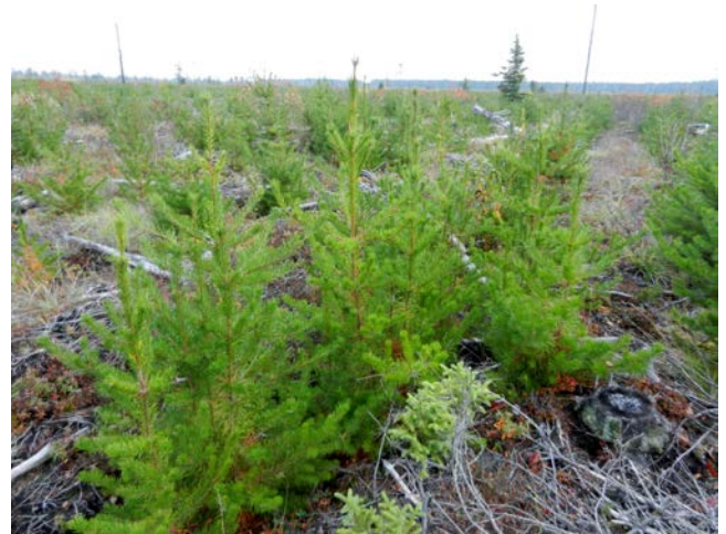
Regeneration from the Spanish Forest site visit

The Silviculture program funds silviculture needs resulting from forces of natural depletion such as fire, wind, insects, disease and flooding and past poor forestry practices. Funding requests are received in five categories: Stand Improvement – intensive stand management, Remediation - stand rehabilitation after natural disturbances, Pest Control, Insolvency and Other -as designated by the Minister. Details on each category can be found on our website.